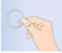
Figure 1 Take NuvaRing out of the sachet