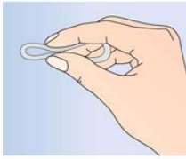
Figure 2 Compress the ring