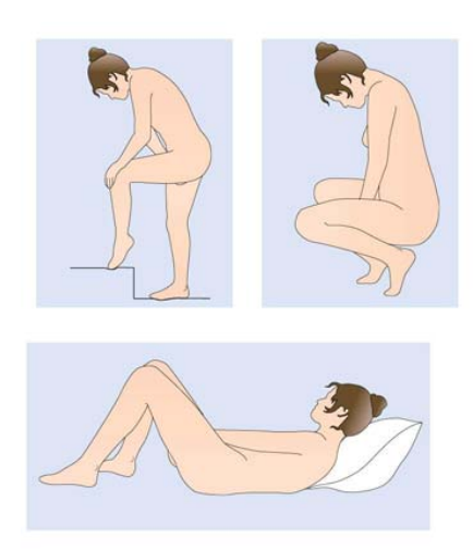
Figure 3 Choose a comfortable position to insert the ring